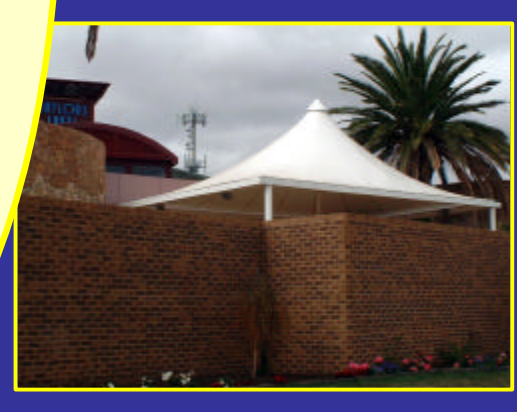
Taylors Lakes Family Hotel, Victoria In partnership with J.W. Sadler Architects