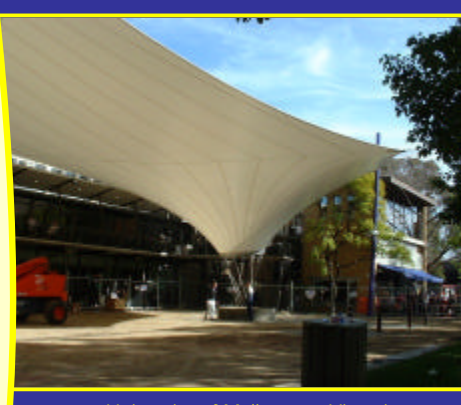
University of Melbourne, Victoria Membrane fabrication and installation for Tecraft