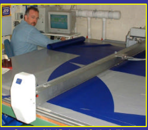
Computer Aided Design and Cutting facilities