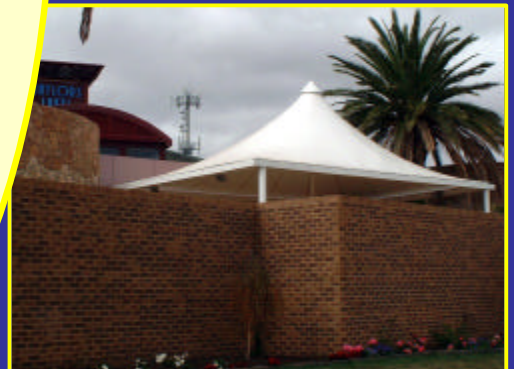
Taylors Lakes Family Hotel, Victoria In partnership with J.W. Sadler Architects