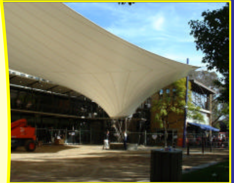
University of Melbourne, Victoria Membrane fabrication and installation for Tecraft