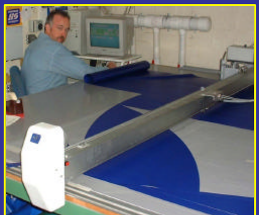
Computer Aided Design and Cutting facilities