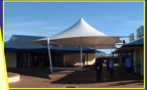
Mowbray College, Victoria Partnership with Tattersall Engineering